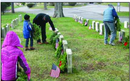
Parents and children laying wreaths on the grave sites.