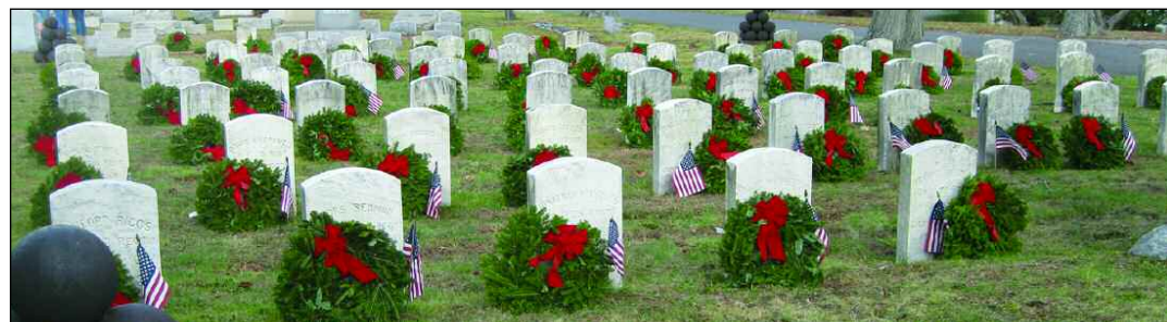
Wreaths that have been laid on the Civil War soldiers grave sites.